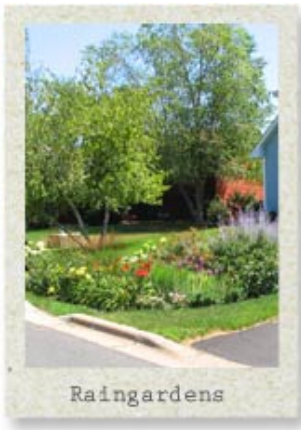
Raingardens are another great way to filter storm water run-off