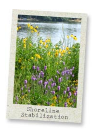
Native plants stabilize shorelines and act as a buffer between your yard and the lake. The roots of native plants filter and absorb polluted runoff and excess nutrients before they ever enter the water.

Are you interested in Shoreline Restoration for your property? To qualify for the DNR grant, private residences must have 75% of their shoreline restored with native plants to create a 25 foot buffer.