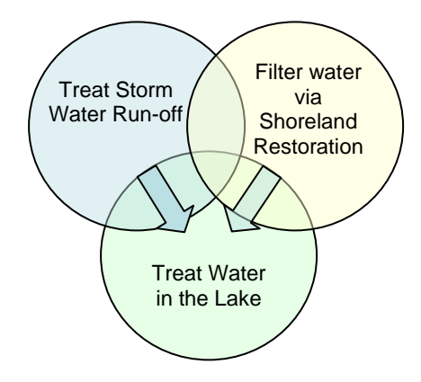
To have a long term impact on clean water we need to clean the water already in the lake as well as the water flowing into the lake